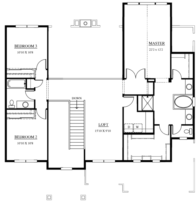
UPPER LEVEL 1402 sq ft FINISHED