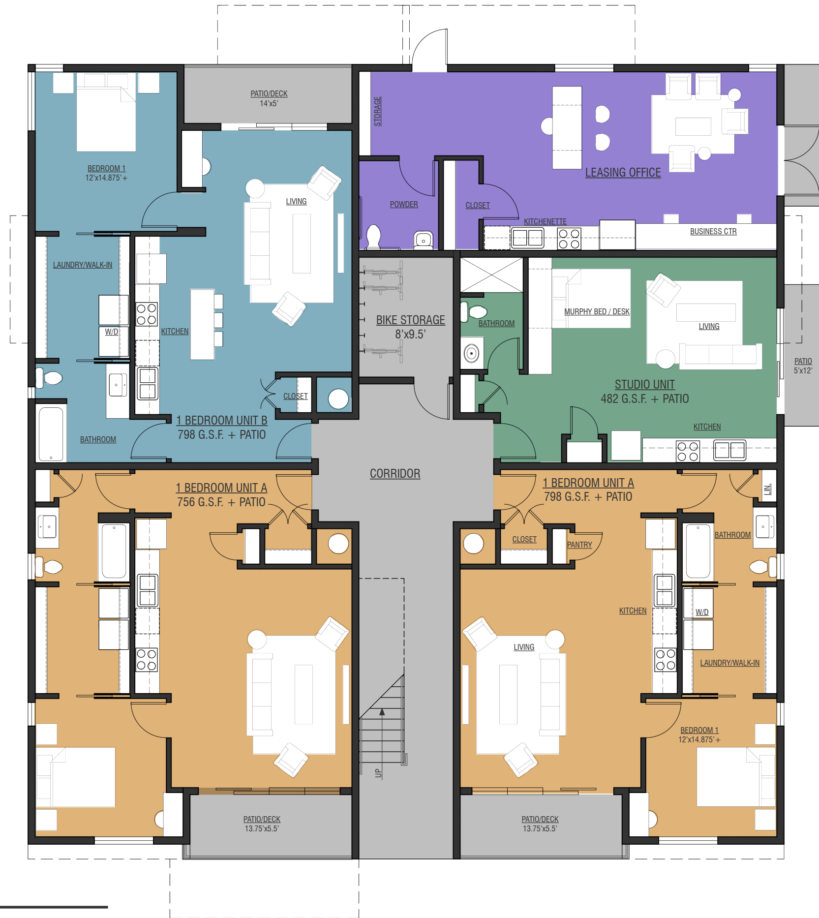
1 FIRST FLOOR PLAN - (3) 1 BEDROOM, (1) STUDIO, LEASING OFFICE 1/8" = 1'-0"