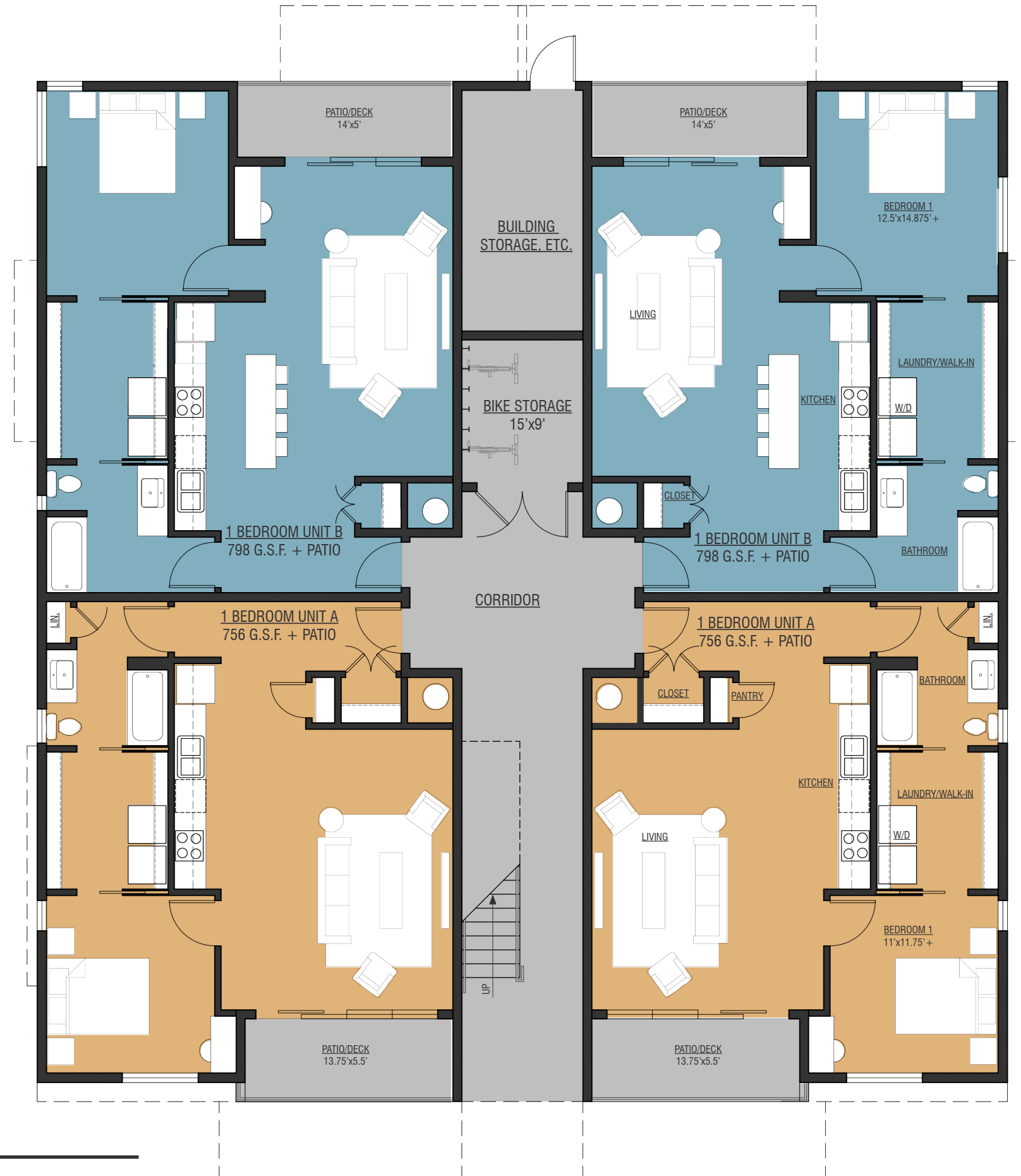
1 TYPICAL FIRST FLOOR PLAN - (4) 1-BEDROOM UNITS 1/8" = 1'-0"